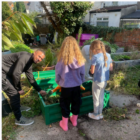
LEFT: Local group Horn Development CIC ran a wellness programme - supported by the UK Shared Prosperity Fund Small Grant administered by C3SC - which included a breakfast social club and gardening with the aim of connecting people to reduce isolation and loneliness.

We want to work with the new Senedd to support the sector to be