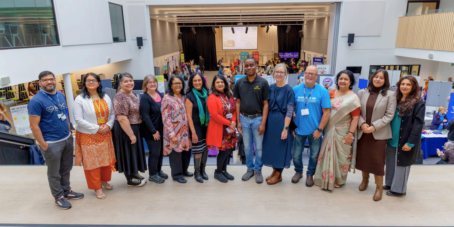
ABOVE: Partners from Muslim Doctors Cymru, Sight Cymru, Diabetes UK, Cardiff and Vale University Health Board, Diverse Cymru, Hindu Council for Wales and The Mentor Ring who supported the Minority Ethnic Communities (MEC) Health Fair 2025 organised by C3SC.